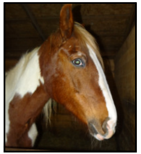
Experanza is a beautiful Paint mare who needs to learn confidence and to feel secure and loved.

wonderful, amazing, gentle horses who have survived many years with a nealectful owner. We believe with all of us working together, we can indeed find them a home together! Call Happy Trails at