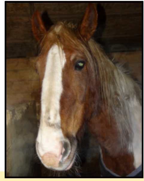
(Above) Esperanza is a beautiful chestnut and white Paint mare who needed to gain back about 300 lbs. She is doing very well with her re-feeding program and we expect a full recovery for her.