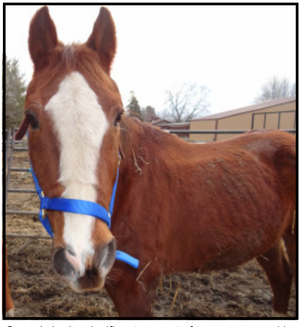
Sueno's had a significant amount of tape worms and is being treated accordingly. He is extremely kind.

three horses. We are willing to try. We are entitled to dream. We always have hope.