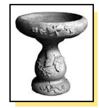
You're sure to find something you'll like!

Many unique items you won't find anywhere else!