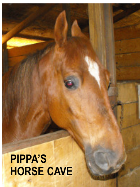
PIPPA'S HORSE CAVE