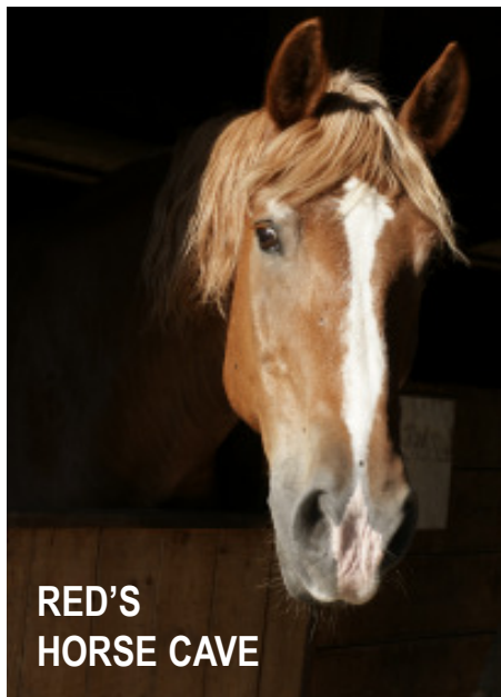
RED'S HORSE CAVE