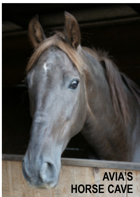
AVIA'S HORSE CAVE