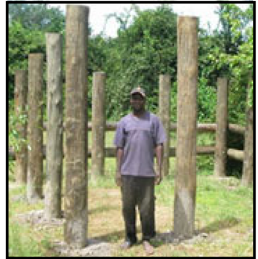
A new shelter in the works.