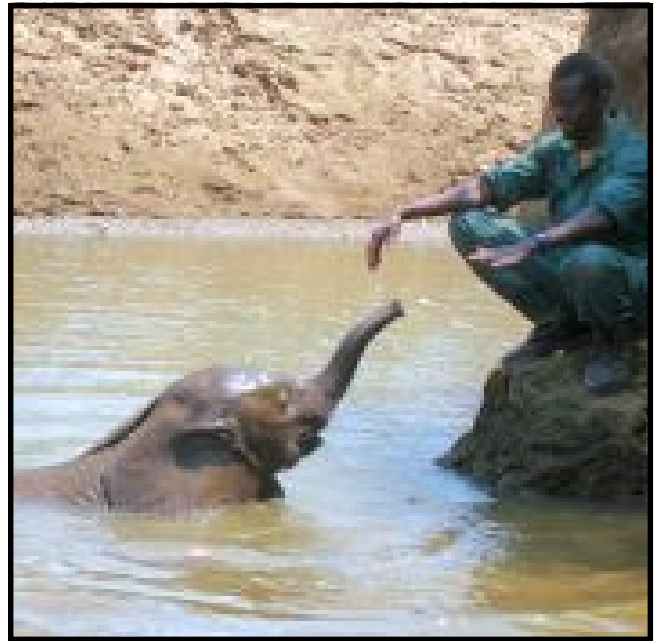
Rescued elephant named Tafika.