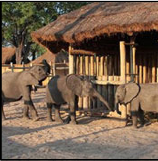
Three rescued baby elephants.