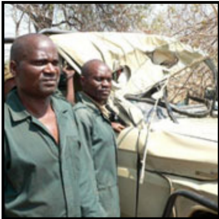
Truck damaged by a mother elephant while attempting to remove a snare from her baby.