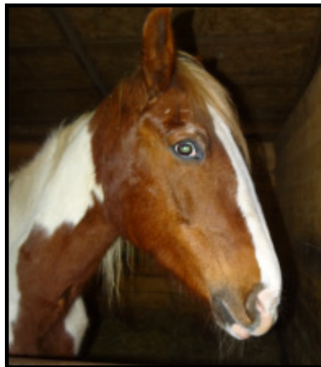
Esperanza needs to learn confidence and to feel secure and loved. Please help us find these horses their forever homes!

who have survived many years with a neglectful owner. We believe that with all of us working together, we can indeed find them a home together! Call Happy Trails at 330-296-5914 for adoption information!