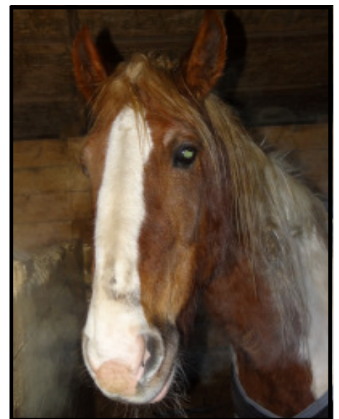
(Above) Esperanza is a beautiful chestnut and white Paint mare who needed to gain back about 300 lbs. She is doing very well with her re-feeding program and we expect a full recovery for her.