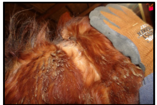
(Above) Both Milagro and Sueno's halters had not been removed for a very long time. They were embedded into their face and into the skin behind their ears.