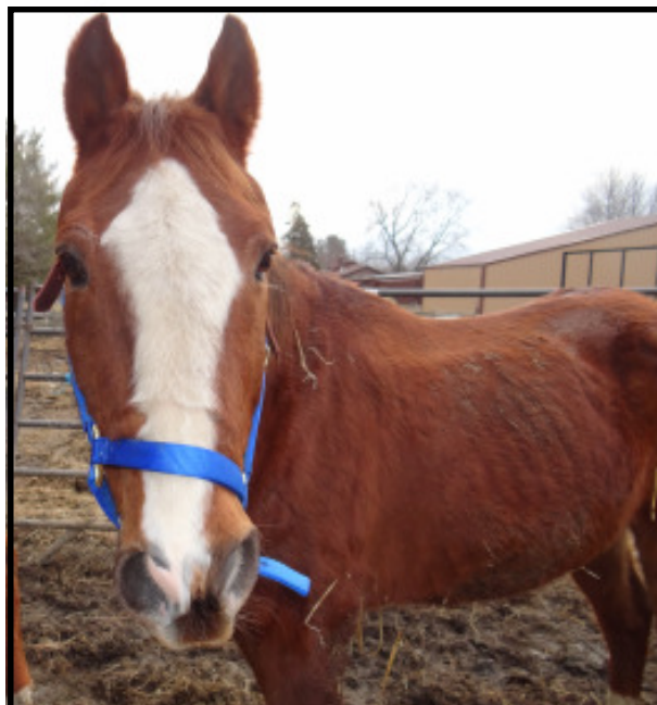
Sueno's had a significant amount of tape worms and is being treated accordingly. He is extremely kind.

Please help us in our efforts to spread the word that we are accepting adoption inquiries on these three wonderful, amazing, gentle horses