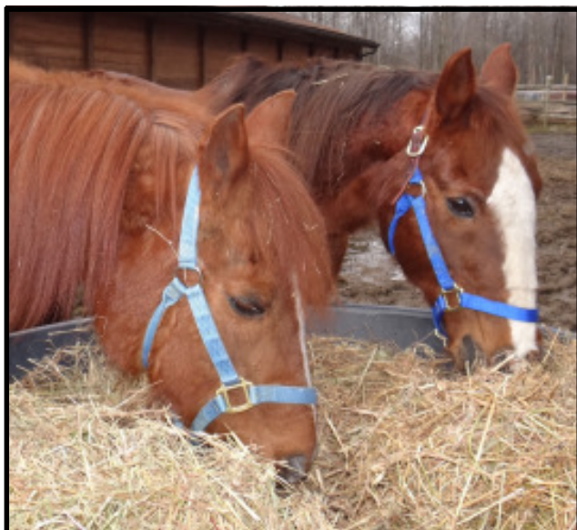
The gentlemen enjoy getting out in the fresh air and sharing hay with each other. Be assured that Esperanza is not very far away.