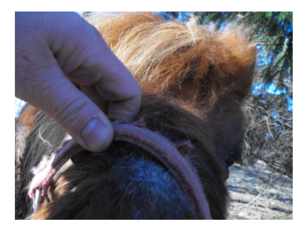
Theodore's halter was embedded in face. His fur had grown around the halter on his nose and had also grown over the halter behind his ears.