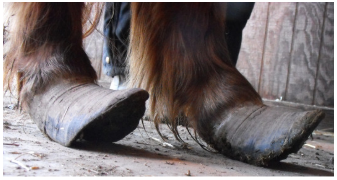
The condition of Theodore's hooves made it difficult for him to walk.