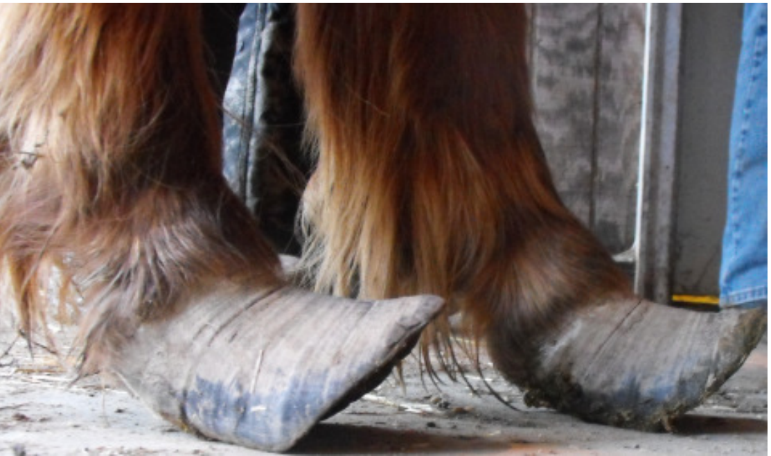
Excessively long hooves create unnatural strain and trauma to the deep digital flexor tendons, and create conditions which can be extremely painful to the horse.

Happy Trails Farm Animal Sanctuary • 330-296-5914 • happytrailsfarm.org