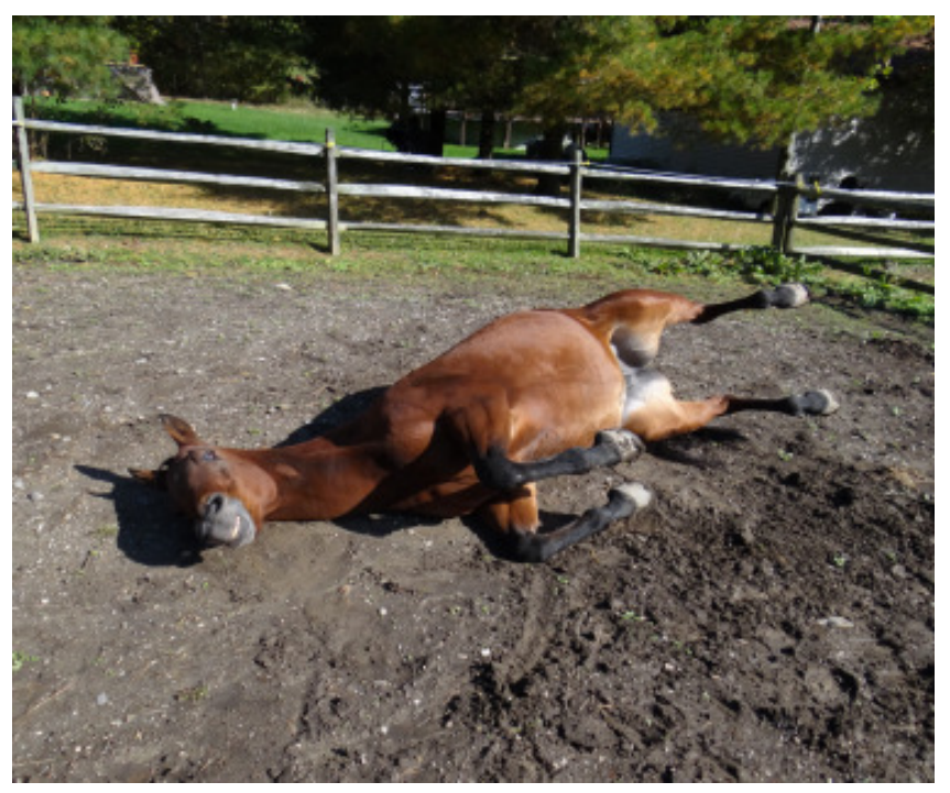
Ooooooooh it feels great to roll in the dirt!