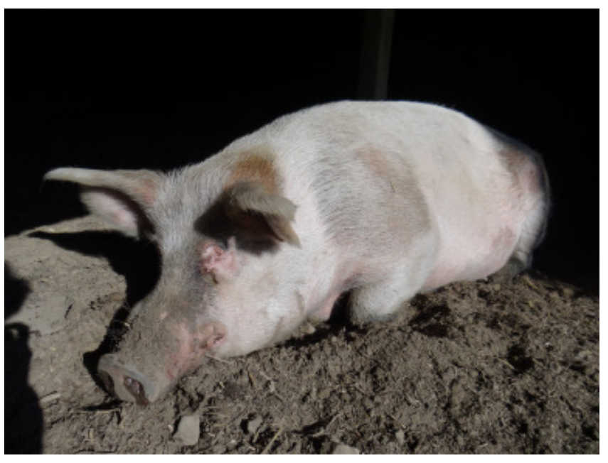
I must practice taking naps in the warm sunshine so I am prepared for summer. I plan ahead! (Life according to Garfunkle the pig.)