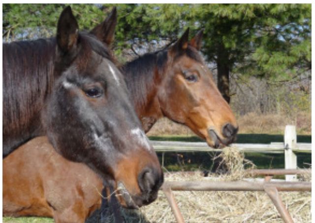
I got hay in my mouth dude. Can't you take our picture later?