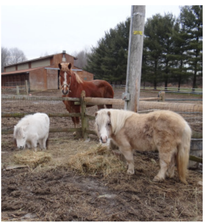
Will they ever grow up to be big like me?