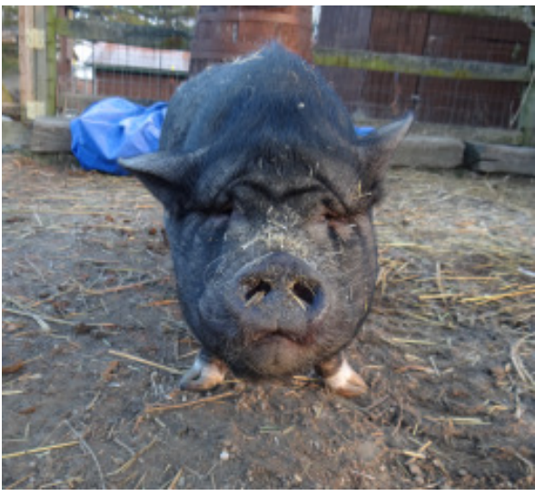
Why yes it is a beautiful day out. I thought I'd go for a stroll around the sanctuary and vist some friends. Walks help my arthritis you know.