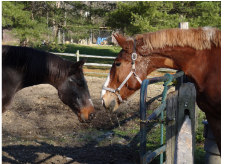
My names "Whoa dammit". What's yours?